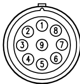
FACE VIEW SOCKET CONNECTOR