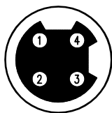
FACE VIEW SOCKET CONNECTOR