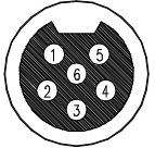
FACE VIEW SOCKET CONNECTOR