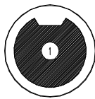
FACE VIEW SOCKET CONNECTOR